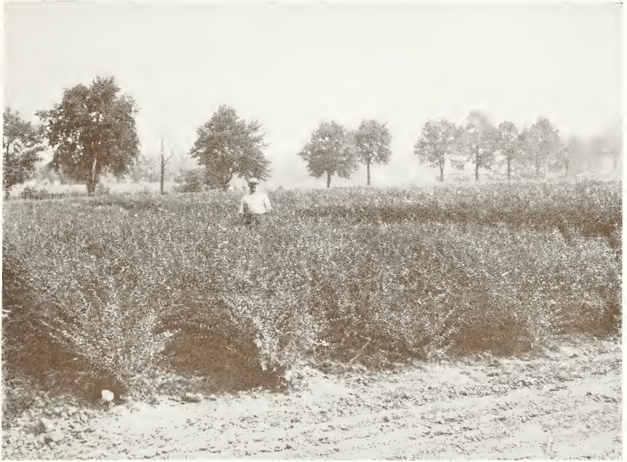
Block of twelve varieties of Cotoneasters, two to three feet.